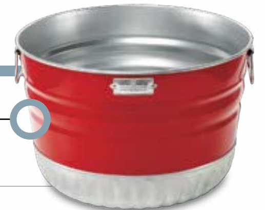
Solid Galvanized Steel Name Plate Riveted to Bushel Basket

⚡ 100% GALVANIZED STEEL ☁️ Stands up to DEMANDING ELEMENTS